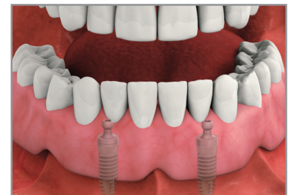
Modified denture is snapped into place providing stability and confidence.