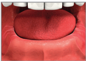
Patient unhappy with denture instability.